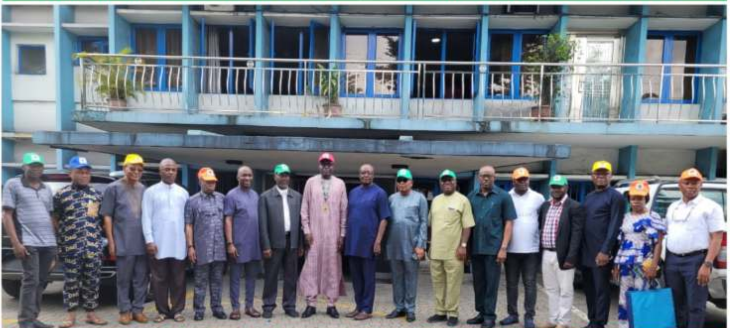
COURTESY VISIT TO NDBDA BY NIHTE