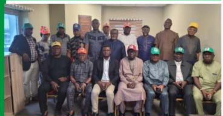
COURTESY VISIT TO NDDC BY NIHTE