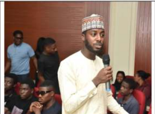
NBRII rep. addressing students