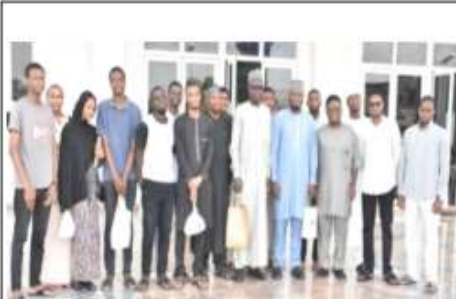
Group photograph with some Nile Lecturers, Students, & NIHTE members.