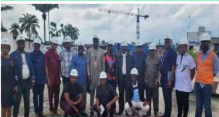
INDUSTRIAL VISIT TO BODO-BONNY ROAD BY NIHTE